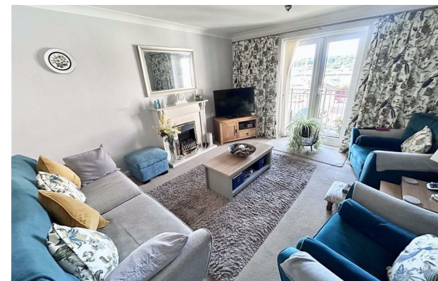
▼ 1st Floor